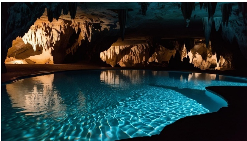
Shenandoah Underground Cave - Pool

This guide takes you deep into seven of America’s most extraordinary underground destinations—where crystal-lined caverns, hidden passageways, and eerie depths reveal stories etched in stone. But these places hold more than breathtaking scenery; they are portals to the past, where echoes of forgotten footsteps linger and shadows seem to whisper untold stories.