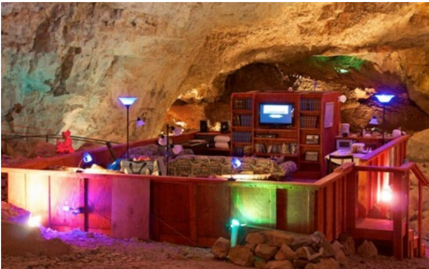
The Caverns Library

This is not just a cave—it’s a luxury suite built inside one of the largest dry caverns in the U.S. Here, there is no sound, no humidity, no natural light—just a vast, ancient space carved by nature over 65 million years.