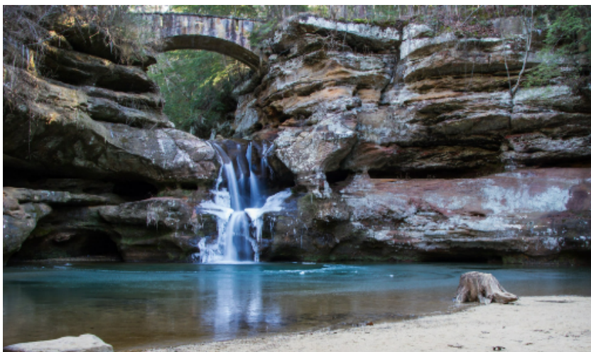
Old Man's Cave

Then there's The Rock House, Hocking Hills' closest formation to a true cave—a place where nature's cathedral walls have sheltered both the living and the lost. Visitors report shadowy figures shifting in the dim light, strange unexplained noises, and an undeniable feeling that the walls hold the memories of passengers long gone.