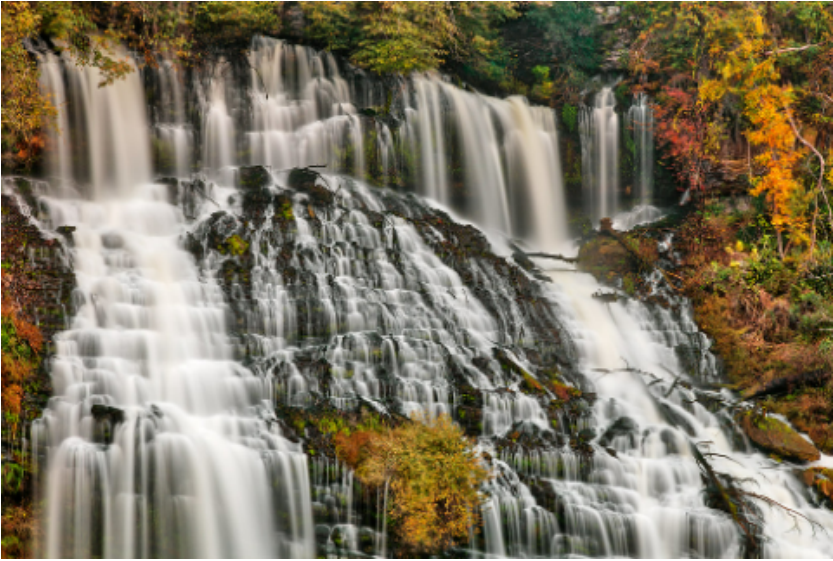
Falls near The Cavern