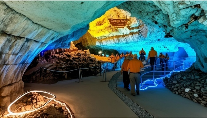
The Caverns Haunted Ghost Tour