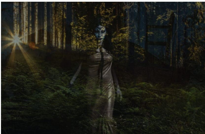
The Bell Witch

While The Caverns is renowned for its unique blend of music and subterranean adventure, it's worth noting that Tennessee's caves have long been associated with tales of the supernatural. For instance, Ruby Falls in Chattanooga has embraced this eerie connection, hosting the "Haunted Cavern" event for over a decade, where visitors experience spine-chilling thrills deep within the cave's passages.