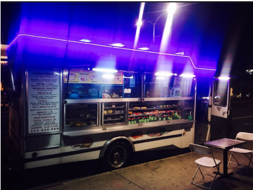
Food Truck Alley