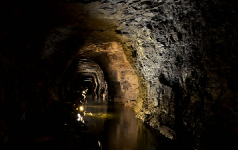
The Cavern’s Ghost Tour